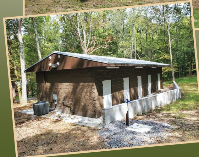
Completed Shower houses